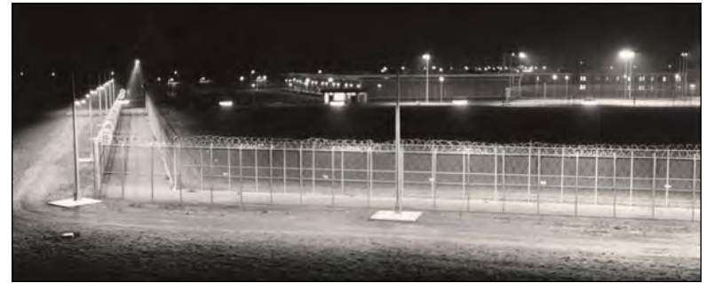
Millhaven Institution in Bath