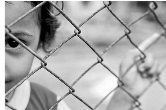
Bill C-31 gives the state the power to detain children.

Bill C-31 amended the IRPA to increase its ability to detain non-citizens of Canada. The bill imbues the Minister of Public Safety (Vic Toews) with the arbitrary power to designate any refugees he wants