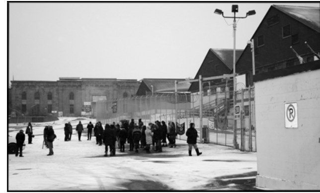
Demo outside Laval Immigration Detention Centre in Montreal