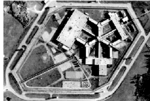
Overhead View of Millhaven Institution

In 2005, the Department of Public Safety prepared a secret memorandum for then Minister Anne McLellan, stating that the Ontario provincial government wanted the federal government to take over responsibility for the imprisonment of security certificate detainees. CSC updated its report from 2001, while the CBSA came up with a document of its own. CSC had the capacity to imprison security certificate detainees, but lacked the necessary authority (to do so contradicts their mandate). CBSA, meanwhile, had the authority to imprison them (through security certificate legislation), but lacked the practical capacity to do so. KIHC came into being as a shady collaboration between CSC and CBSA . Essentially, CSC would operate KIHC, while CBSA would manage it.