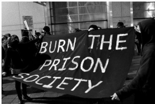
Sounds good to us!

These services included educational programs, recreational programs, paid work, trailer visits with spouses, library resources, and a grievance process involving an external ombudsman. Despite having never even been charged or convicted of any crime, the Secret Trial Five received worse treatment than federal inmates in maximum security conditions (treatment that is already appalling).